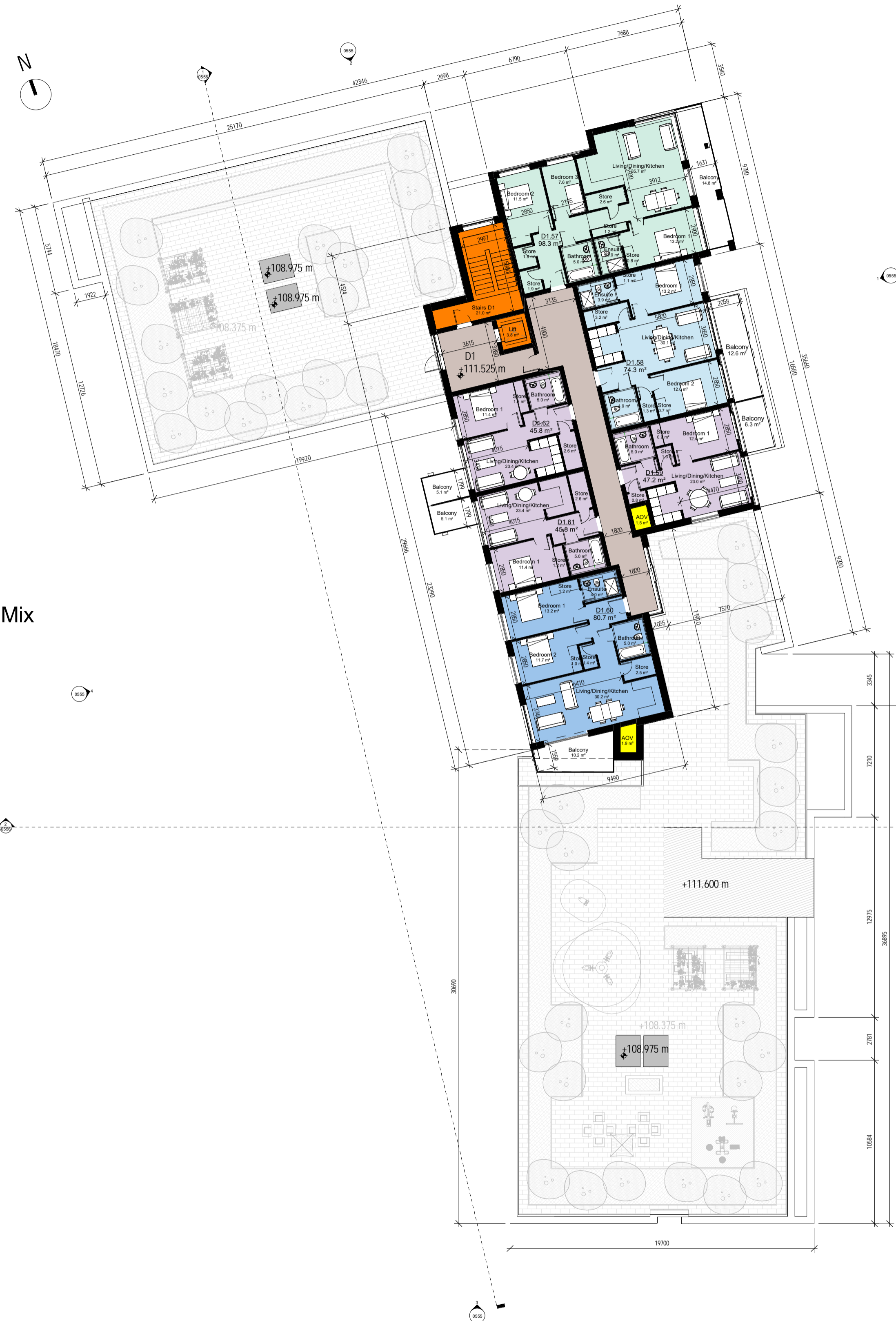
Block D - Proposed Seventh Floor Plan 1 : 200